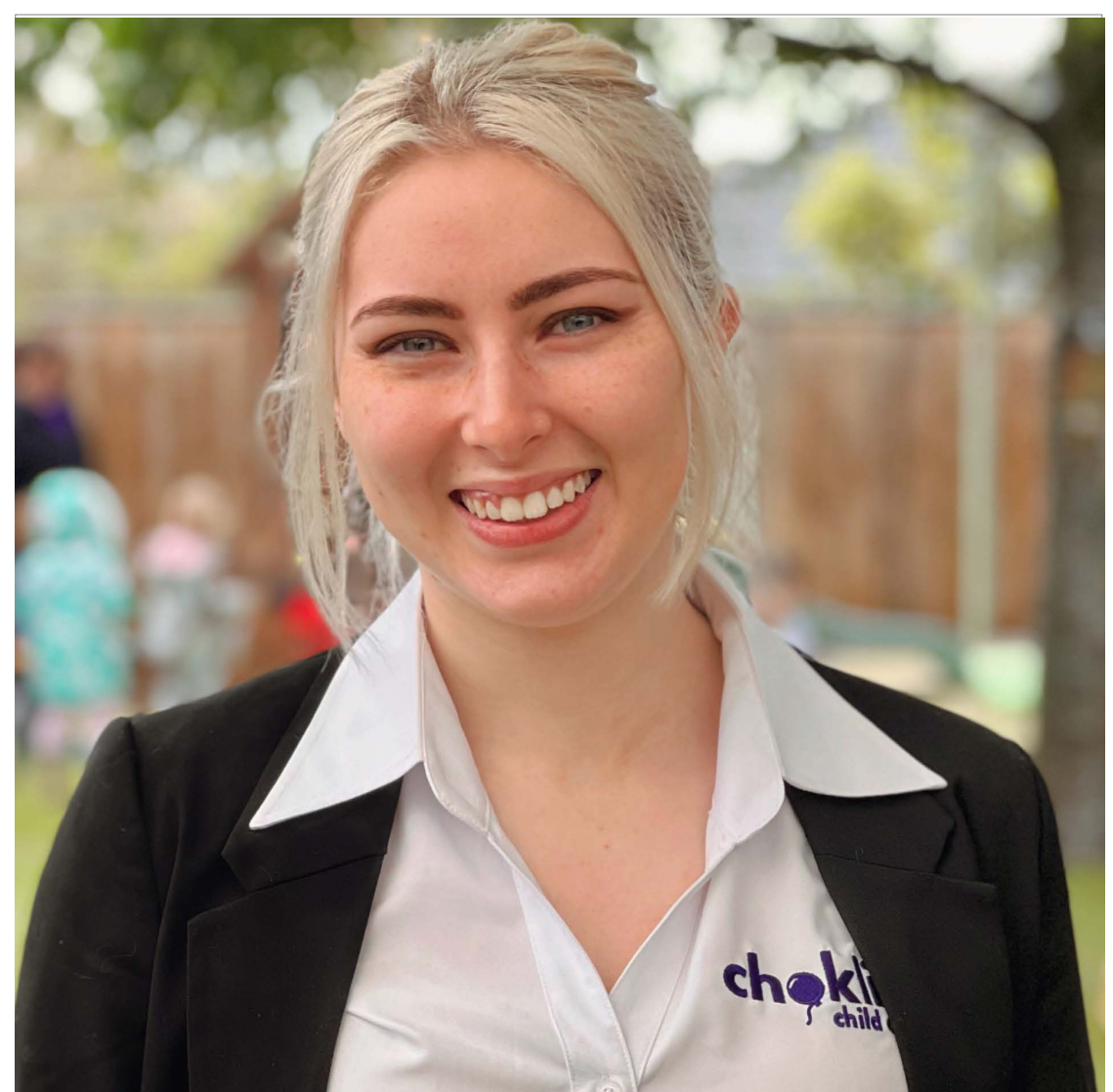
Savannah Curriculum Coordinator